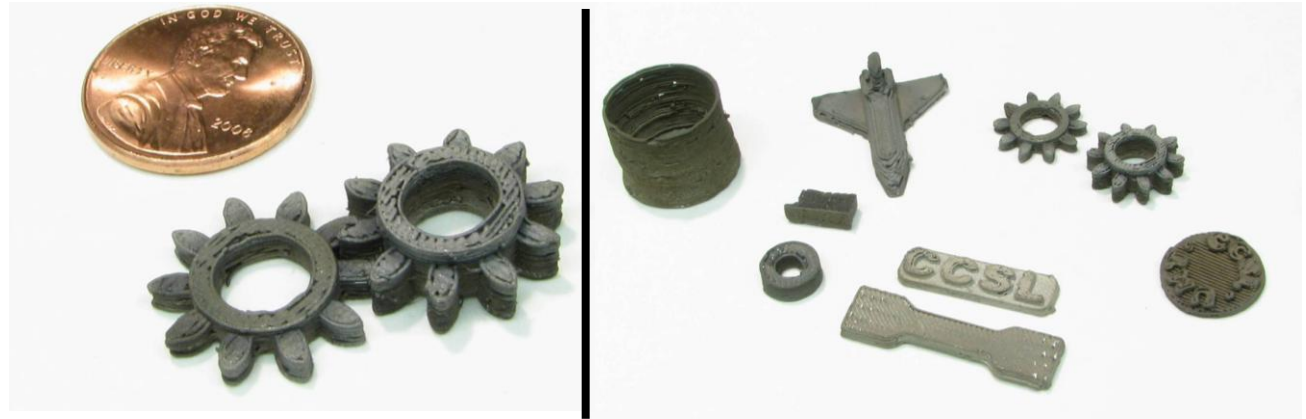
Figure 2: A variety of example parts after sintering

A variety of printed and sintered parts are shown in Figure 2. All of the parts shown have a bead size of .013 in. Of particular interest is the cup with a thin wall that is two beads thick and about 50 layers tall. No significant sagging was seen while printing and it is likely that the material can sustain even taller structures.